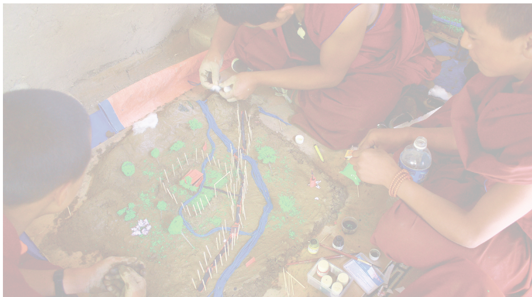
Making site models, India