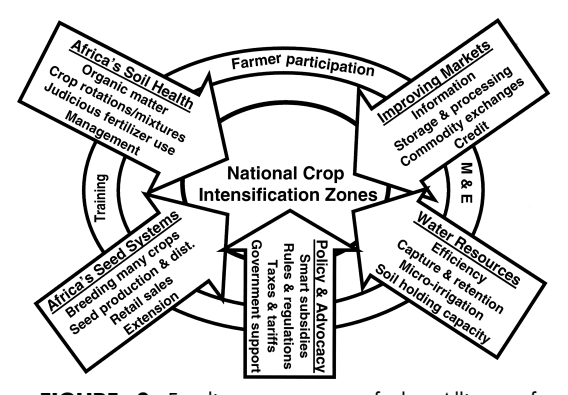
FIGURE 3. Funding programs of the Alliance for a Green Revolution in Africa. M&E, monitoring and evaluation.

and the Rockefeller Foundation provided $50 million to AGRA to initiate its funding program on Africa's seed systems. In late 2007, the two foundations committed $180 million to AGRA for its soil health program. AGRA is currently developing a proposal of roughly similar magnitude on building markets that will soon be submitted to the two foundations and other donors. Additional proposals will be developed by AGRA, and AGRA might host funding programs developed by others as long as they reinforce AGRA's programmatic mission.